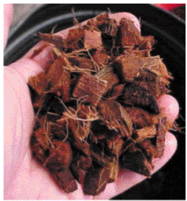
Hydrated Medium Coconut Husk Chips

less sunlight and somewhat cooler temperatures in the greenhouse.