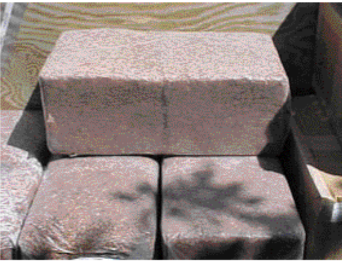
Compressed Bales of Coconut Husk Chips

Like many Paphiopedilum and Phragmipedium growers, we have depended on bark based potting mixes for 20 years. We used small bark, extra coarse horticultural perlite (despite the name, it's pretty small), and chopped New Zealand Sphagnum moss for smaller pots and medium bark, #4 spongerock, and chopped New Zealand sphagnum for larger pots. recent years we'd added either #2 or #4 charcoal, depending on pot size. While results have generally been good, there have been a number of problems to deal with. Sequoia brand bark (the only brand we found suitable for Paphs) supply has had some interruptions, and a few years ago the quality was very low, basically being pre-broken down before you received it. This spring