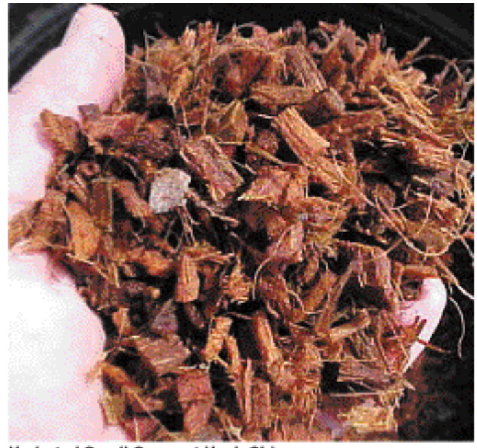
Hydrated Small Coconut Husk Chips

The other major problem associated with bark mixes is their rapid break down. The fine bark mixes are especially prone to this, with noticeable deterioration (with resultant loss of aeration and increase in drying time) in as little as 3 months, and significant deterioration within 6 months under our culture conditions. For a very small collection this is resolvable by very frequent repotting, but in a larger collection this is not feasible. And with the weather conditions found in the Northeastern US where we are located, especially in the winter, we need to maintain a freely draining mix that dries within a few days, when there is