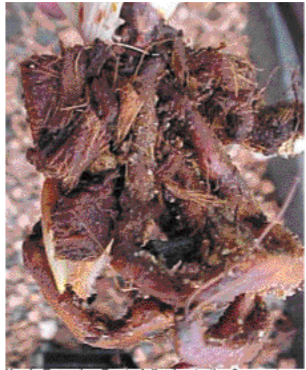
Newly Emerging Roots Adhering to the Coconut Husk Chips Just a Few Weeks After Repotting

We add aliflor and charcoal to the husk, and for Phrags also a bit of heavy aggregate (#1 crushed sandstone). Our formulas, which will probably be tweaked a little over the next year, are listed later in the article. Aliflor is a kilned clay pellet that is roughly round in shape and available in three sizes. It is added to the mixes to open them up a little and to add weight to the mix, which helps to anchor the plants' stability in the pot. It is an additive in a class that is frequently referred to as lightweight aggregates. Other lightweight aggregates that are commonly used are expanded shale and lava rock. We have settled on the aliflor due to its uniformity in size and availability to us. For larger pot mixes, #2 charcoal is added to the mix, for smaller pots #4 charcoal is added to the mix (yes, charcoal size numbers are the reverse of sponge-