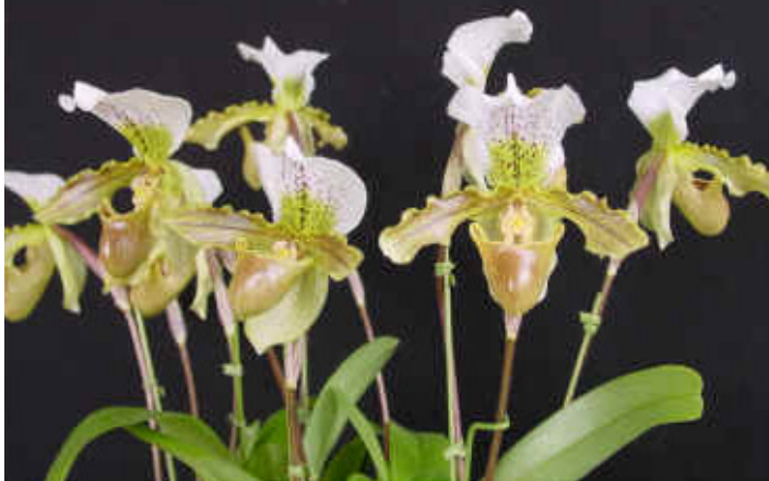
Paph. Leeanum (spicerianum x insigne)

Paphiopedilum spicerianum was described by Reichenbach in 1880 from a collection of mixed Paphiopedilums made in India. The species is distinctive for its funnel-shaped dorsal sepal which is dominant in first generation hybrids, Paph. Leeanum ( x insigne ) being one of the most popular and highly awarded. The species is from elevations of 1000-2000m and requires cooler intermediate conditions. Due to its size and ease of culture, Paph. spicerianum makes an excellent choice for growing on the window sill or under lights.