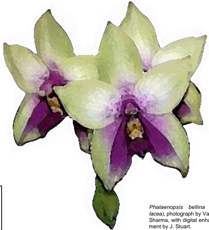
Phalaenopsis bellina (violacea)

DON'T FORGET TO BRING YOUR BLOOMING ORCHIDS FOR THE MONTHLY SHOW TABLE!!!