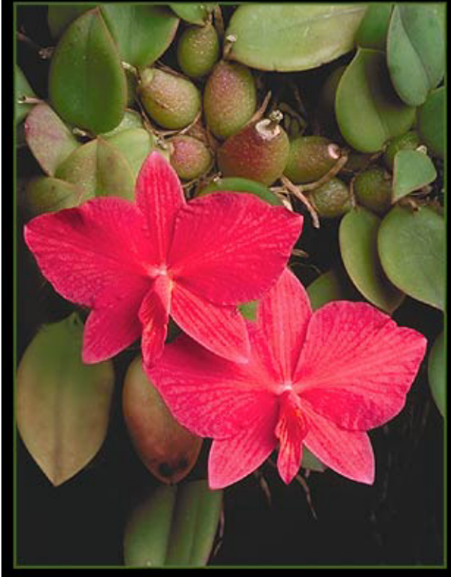
Sophronitis brevipedunculata

Sophronitis brevipedunculata: For many years this species was considered to be a variety of Soph. wittingiana. Now it is accepted as a separate species, producing proportionately large salmon to rose pink flowers, roughly 2-3" across. From the interior of the Brazilian state of Minas Gerais at elevations of 1500-2000m, it can usually be found growing on Vellozia bushes. This habitat experiences hot dry days and cold dewy nights. Although not as showy as it's close cousin Soph. coccinea, brevipedunculata will tolerate less cool conditions and is generally of easier culture, making it a worthy subject. Grow Soprhonitis brevipedunculata on a cork slab under moderately bright light and cool to intermediate temperatures.