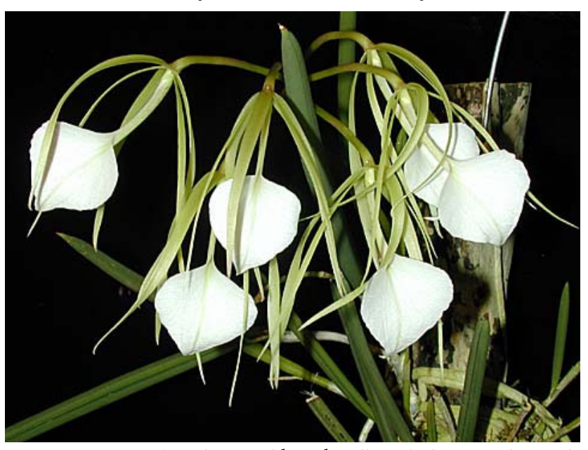
Above: Brassavola nodosa : Although collected plants can be recalcitrant to flower, those grown from seed flower much more regularly and easily.

Dendrobium gonzalesii (ceraula) is closely related to the elegant Dendrobium victoria-regina—both have flowers that are as close to true blue as possible in the orchid world, and as such can be spectacular in bloom. This Philippine species has clusters of 1-2" flowers that are produced along semi-pendulous canes up to a foot in length. Bright light and intermediate to cool conditions are required, along with a good amount of humidity. High-quality water, and lots of it, is also a plus.