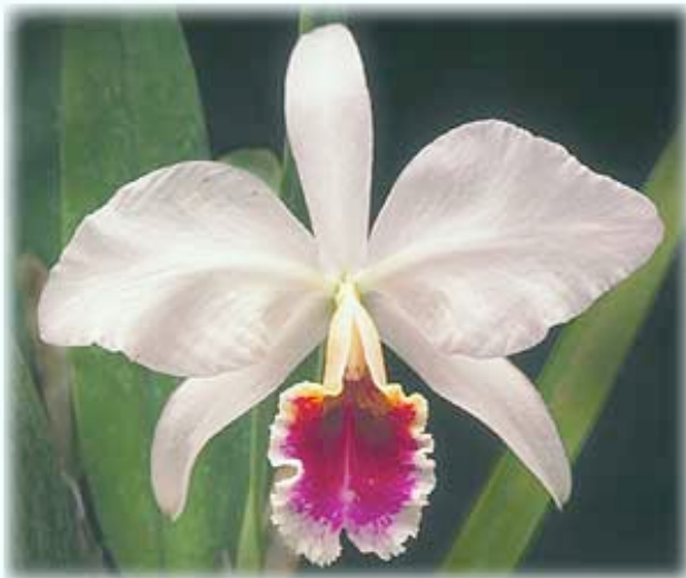
C. percivaliana 'Carace'

are numerous other color forms and several awarded grexes with C. percivaliana 'Summit' FCC/AOS perhaps being the most widely known. Some varieties are known as "grandifloras" and suspected to be tetraploids. Another notable "Perci" is the albescent C. percivaliana 'Sonia de Urbano' which has several awards in its native country. The flowers have the faintest trace of color offset by an old gold lip. C. percivaliana 'Carache' is a well-known semi-alba grex with a richly-colored lip, the lip color approaching burgundy wine.