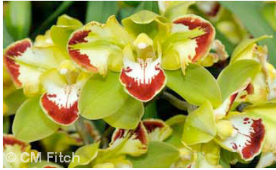
Cymbidium Vidar 'Harlequin' in ground bed.

orchids. Small tropical trees and other palm species are perfect places in the displays for epiphytic orchids, most hung still in pots hidden by clumps of Spanish Moss, the bromeliad Tillandsia usneoides .