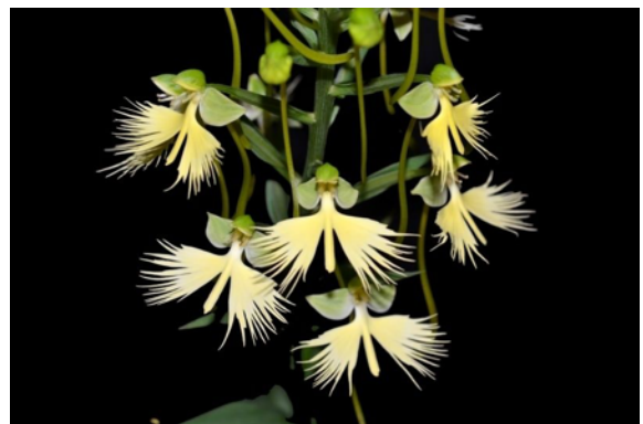
Habenaria Light Wings 'Matt's Lemon Gem' HCC/AOS