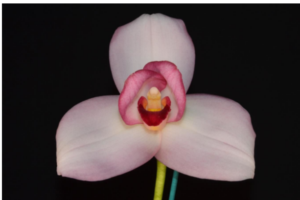
Lycaste Spring Present 'Redwood' AM/AOS

There are also many secret recipes growers use that supposedly produce stronger plants or more flowers. Certainly, vitamins and micronutrients are as essential as the building blocks of plant growth mentioned above. Elements such as magnesium, boron, calcium, carbon and others are required for strong plant growth. All in all, although there are certain practices that are documented as being helpful, it has not been proven that supplements actually contribute to improved growth in orchids — but it probably doesn't hurt to use them.