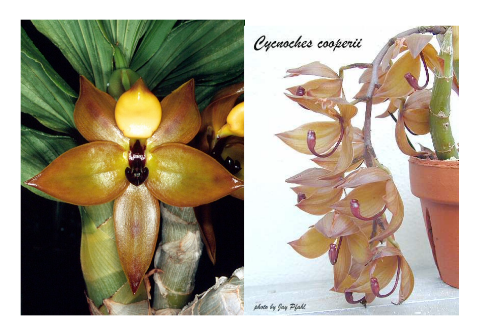
Female flower Cyn. cooperii

Cynoches are one of the most graceful and elegant of the orchids. They are named the Swan-Necked orchid from the long column on the male flowers which resembles a stretched out swan neck and the sepals and petals which remind one of a bird in flight. They produce pendulous inflorescences of either male or female flowers with up to 20 flowers per male inflorescence -- fewer on the female spikes. See the difference in the flowers below: