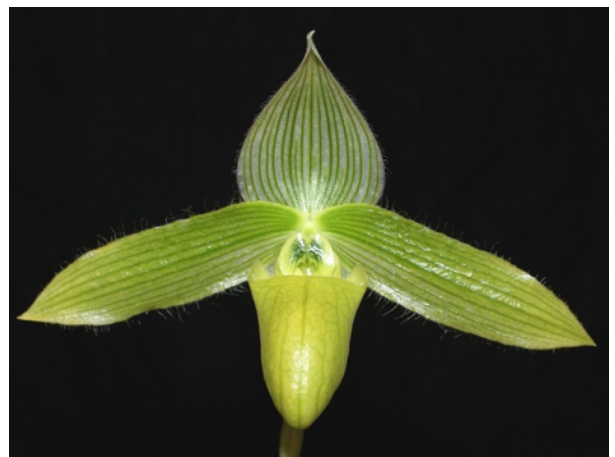
Paphiopedilum Saiun 'Forest Park' AM/AOS