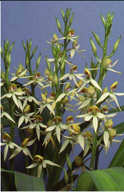
Prosthechea cochleata var. cochleata 'Sockie' CHM/AOS 1) Prosthechea cochleata var. cochleata , World Checklist of Monocotyledons