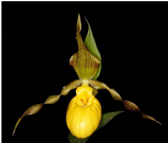
Cyripedium parviflorum var. pubescens 'MoJo' AM/AOS