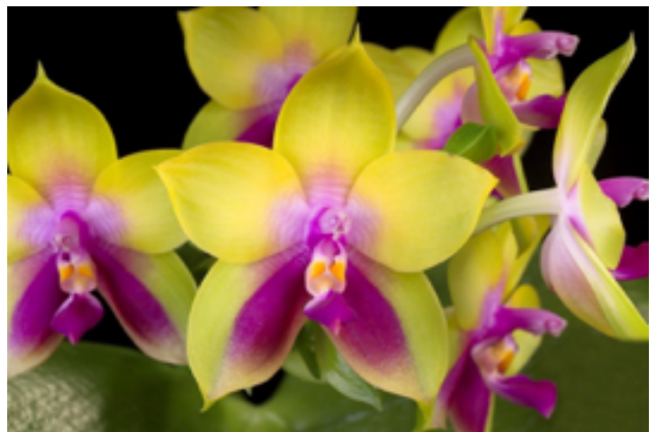
Phalaenopsis LD's Bear Queen 'Alma' AM/AOS

Go to marlowsorchids.com for more information and directions.