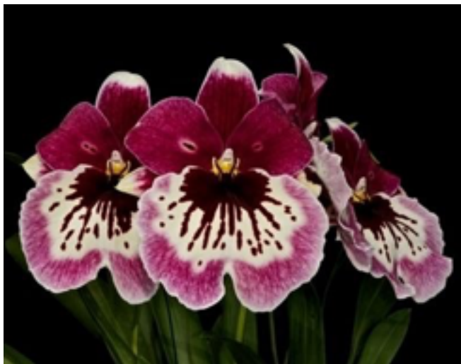
Miltoniopsis Maui Tropical Sunset 'WOW' AM/AOS

~ Holiday Luncheon ~ Everyone brings a dish to pass.