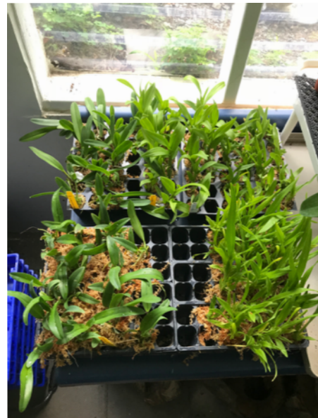
Seedlings for the September 9th Workshop. See page 8 for IMPORTANT details!