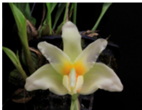
Stanhopea saccata 'Dude' AM/AOS