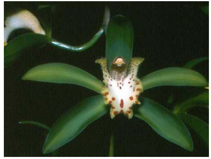
Cymbidium hookerianum 'Drouin' AM/OSCOV

In January and February not many orchids are in flower but several of the thick-leafed cymbidiums are usually in bloom. One is Cymbidium aloifolium , the type species for the genus (which means that it was the first cymbidium described). It is appropriate that it should be the first species to flower, together with Cymbidium finlaysonianum , C. bicolor , C. atropurpureum and C. rectum . All of these species require heat and we therefore grow them with our cattleyas. Their need for heat is not surprising because they grow in the lowlands of Asia, often in full sunshine.