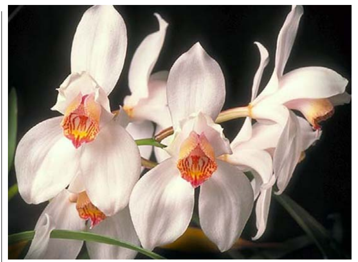
Cymbidium erythrostylum However, C. suavissimum, which can be grown without heat, also flowers at this time. It is closely related to C. floribundum but it has upright spikes and produces its flowers about three months later than C. floribundum.

In March and April C. lancifolium comes into flower. Also known as C. aspidistrifolium , it forms a small plant with tapered leaves. Growing in leaf litter on the forest floor, each bulb develops on an ascending rhizome so that the plant is continually raised above the accumulation of leaf litter. Due to the altitude at which this plant grows in nature (up to 2300 m) it will grow cold in Melbourne.